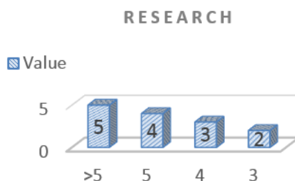
Figure 4. Lecturer research.

4.1.3. Research criteria. Research criteria that have been carried out since being determined as permanent lecturers are the third requirement needed for decision making based on the amount of research that has been done since it was determined as a permanent lecturer. The criterion value data is presented in figure 4 which is the interval of research that has been carried out since it was determined as a lecturer as follows: