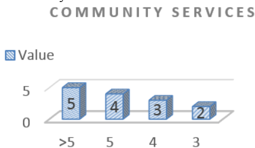
Figure 5. Devotion of the community.

4.1.4. Criteria for the number of services to the community. The next requirement is needed for decision making based on the large number of activities in the community service since it was determined as a permanent lecturer at UNIPMA. The criterion value data is presented in figure 5 where the description of the community service interval is as follows