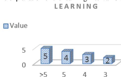
Figure 3. Learning criteria.

4.1.2. Learning criteria. Learning Criteria is the second criterion needed for decision making based on academic performance for Thesis Supervisors, Final Assistants (TA), Practical Work Guidance (KP) and Student Creativity Program (PKM) supervisors. Mapping the value of the learning criteria is presented on figure 3 where the explanation of the learning interval is explained as follows.